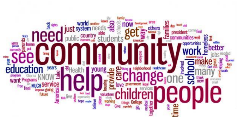
Figure 1. Community Health.